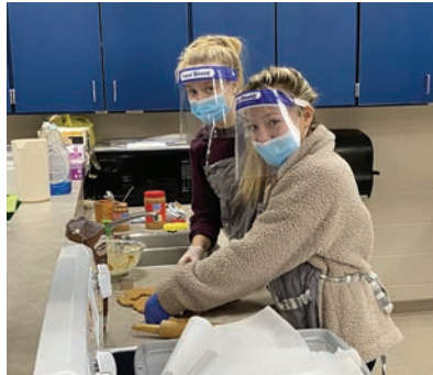
Rural systems, such as the Blair-Taylor School District in Wisconsin, have been able to keep students in classrooms all school year.

The size of the co-op has also allowed the leaders to develop more substantial partnerships with businesses and higher